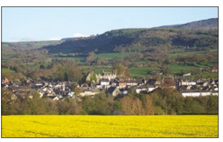
Tranquil setting overlooking the River Wye. 5 minutes walk from the centre of town. Ideal for Offa's Dyke and Wye Valley walkers.